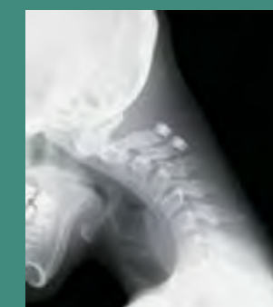
Without Dynamic Visualization™

Dynamic Visualization™ is an FDX Console exclusive.