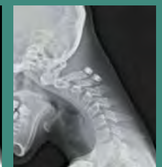
With Dynamic Visualization™